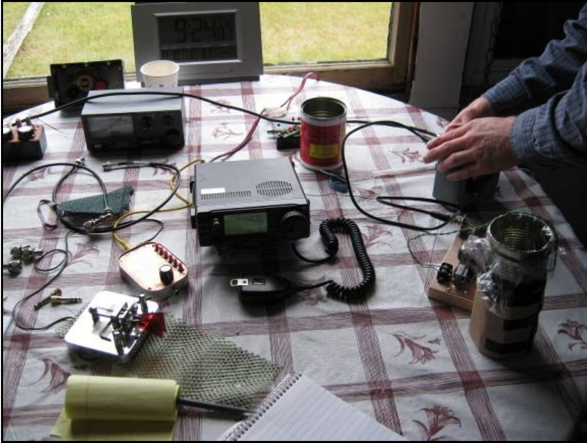
Mike starts hosing up the New England Code Talker.