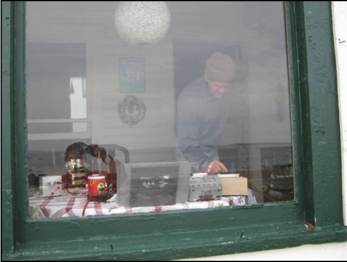
Now I'm looking in at the operating position...