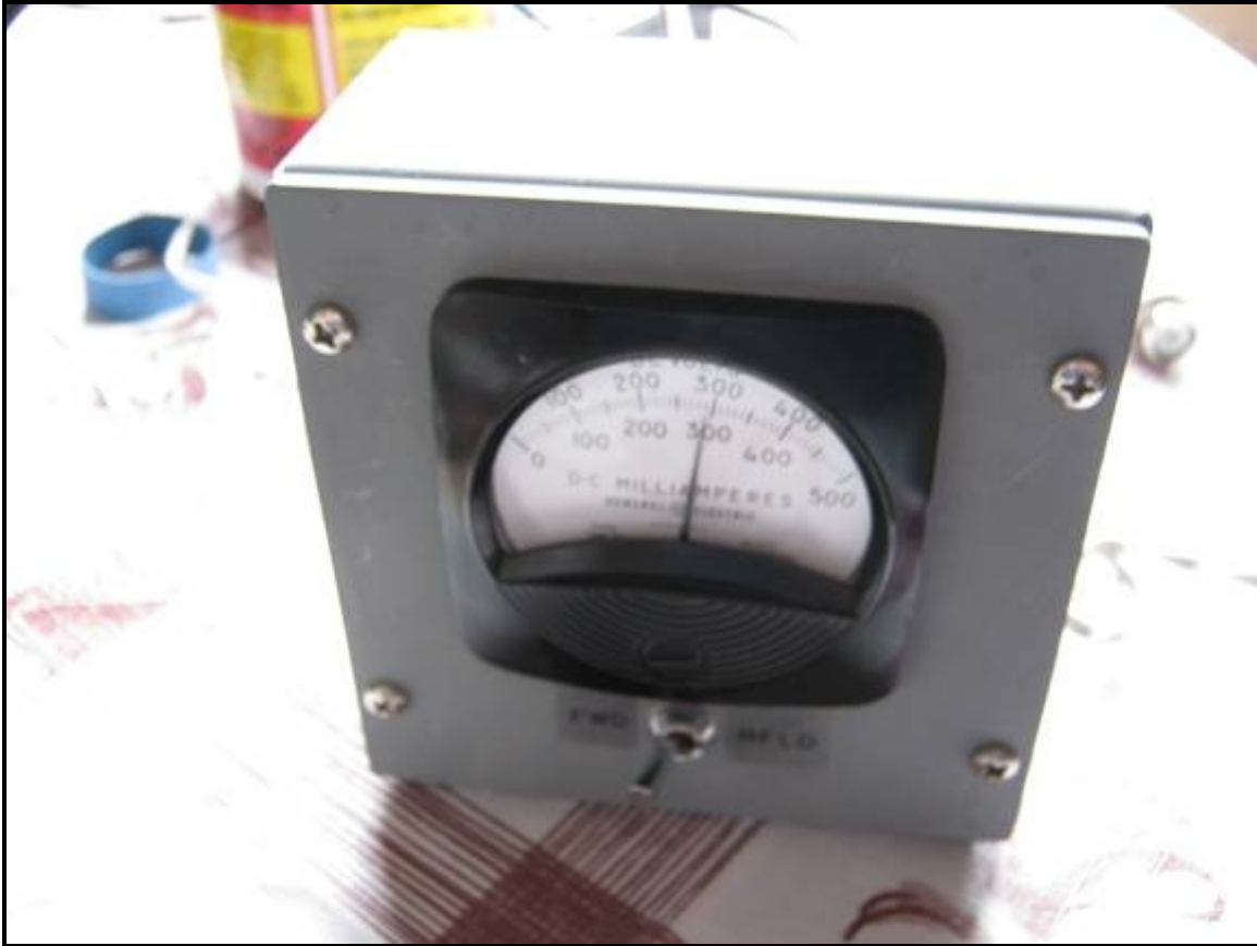
Here is the test signal out of the Code Talker transmitter. Full scale on the homebrew wattmeter is 20 milliwatts...