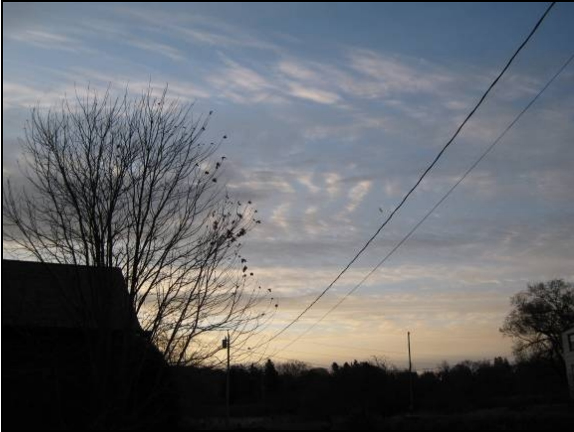
The sky on Wednesday morning.... You can see a small flag on Seab's kite line where it is draped over the power line.