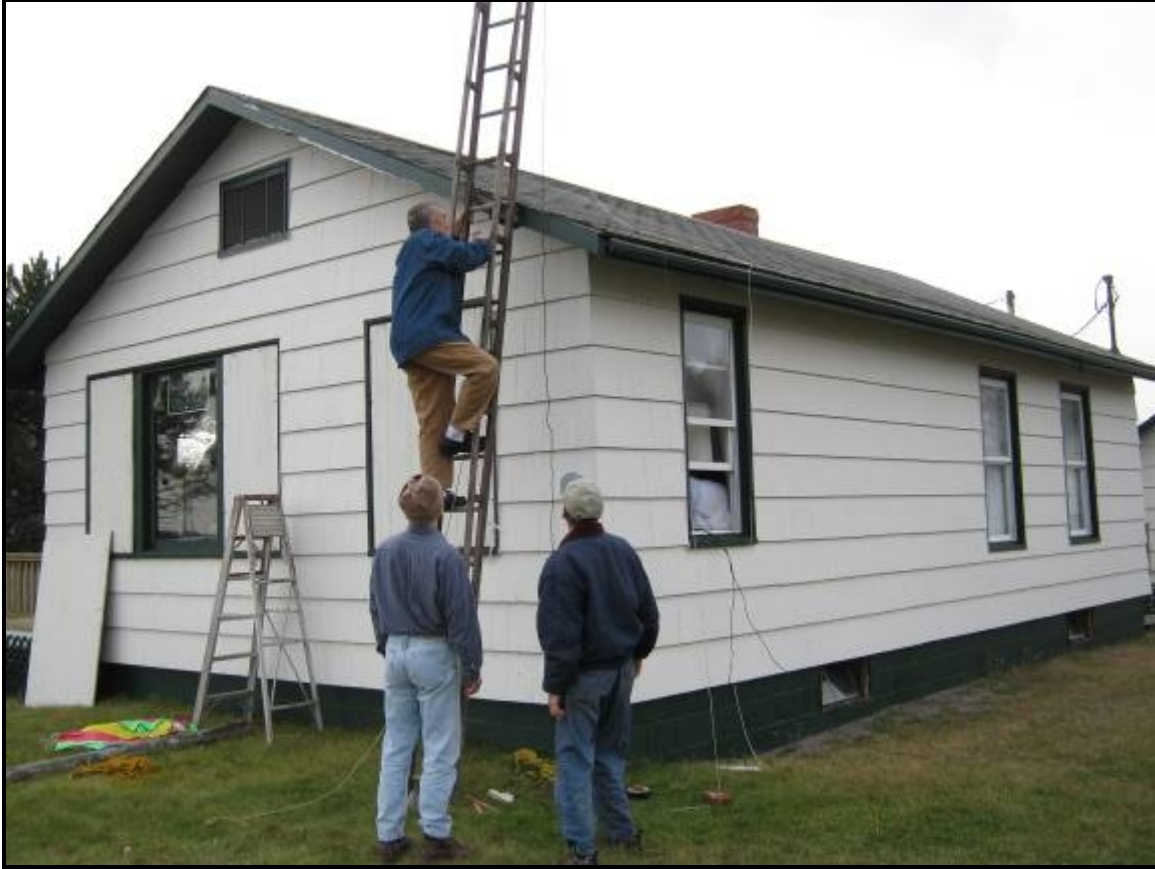
Another picture of the antennas under construction.